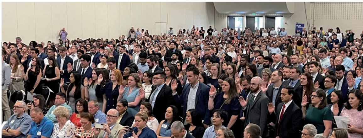
Candidates took the Oath of Office at the June 21, 2025, swearing-in ceremony.