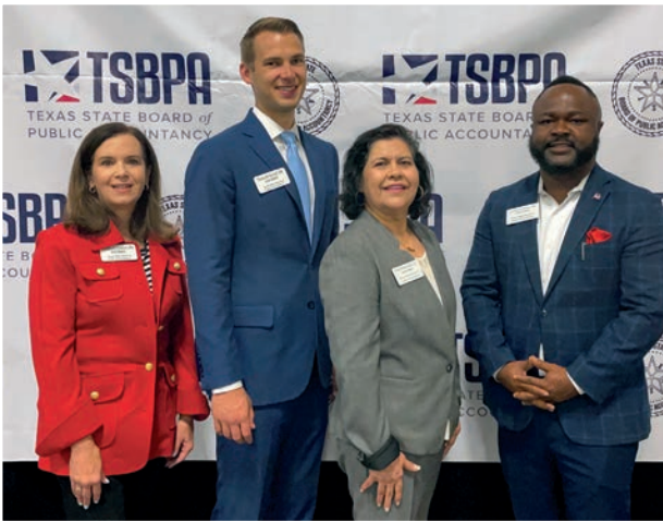
TSBPA Board members welcomed new CPAs to the profession at the swearing-in ceremony on June 21. Thank you for honoring and paying tribute to the newest Texas CPAs.

On June 21, 2025, the Texas State Board of Public Accountancy (TSBPA) held a swearing-in ceremony to honor and pay tribute to the newest Texas CPAs. There were 789 individuals eligible to receive their certificates and take the Oath of Office at the biannual TSBPA swearing-in ceremony. Congratulations and welcome to the profession!