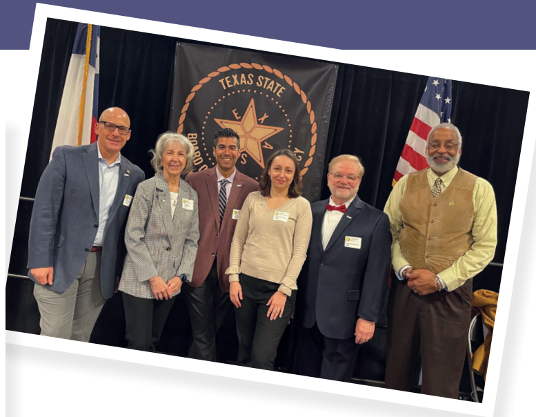
A very special thanks to the TXCPA Austin members who volunteered their time on a Saturday to help us celebrate and welcome the new CPAs into the profession!

The TSBPA congratulates all of the outstanding candidates for their achievements.