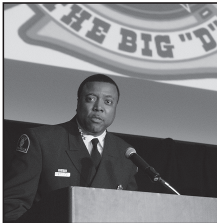
Dallas Fire-Rescue Chief Louie Bright at a previous awards banquet

The 2015 Dallas Fire-Rescue Department Awards Banquet will be held Saturday, May 30, 2015. The location will be the Frontiers of Flight Museum, 6911 Lemmon Avenue in Dallas.