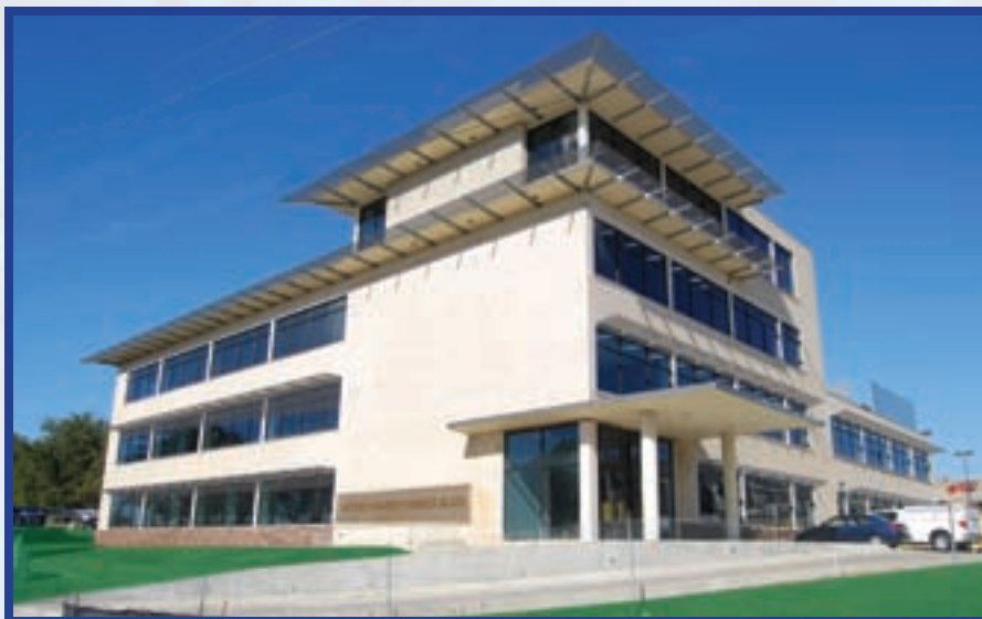
Our new headquarters at 4100 Harry Hines Boulevard