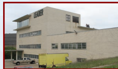
4100 Harry Hines, Dec. 2006

For an animated conception of the exterior of the completed project, visit our Website at: www.dpfp.org .