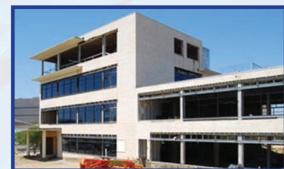
4100 Harry Hines, April 2008