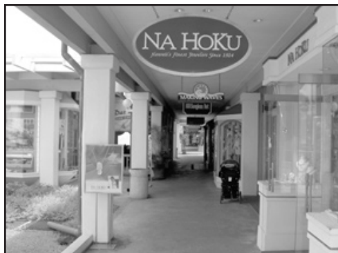
Retail Center in Kauai, Hawaii