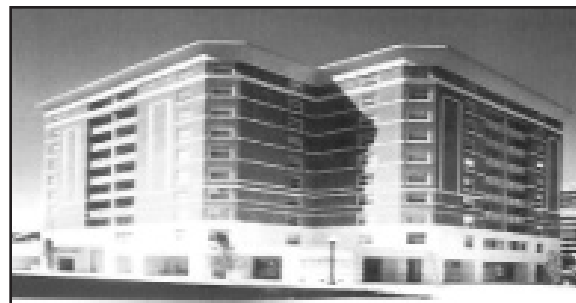
High-rise Apartment Building in Arlington, Virginia; Sold earlier this year