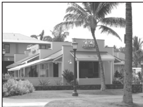
Retail Center in Kona, Hawaii