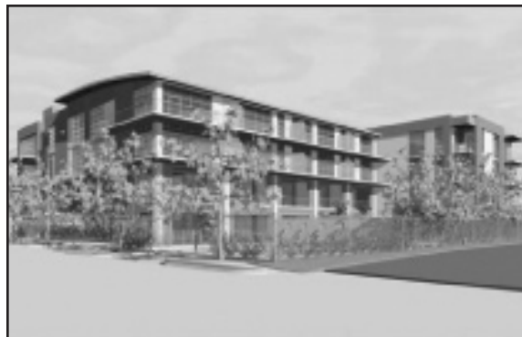
Artist Rendering of a Dallas Condominium Development Currently Under Construction

The Board sold its holding of a high-rise apartment complex in Arlington, Virginia. The property had been purchased in September, 2004 for $6.4 million. It was sold at a 49% profit after holding the property only four months. GMAC was the manager.