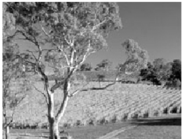
Casella Vineyards, New South Wales