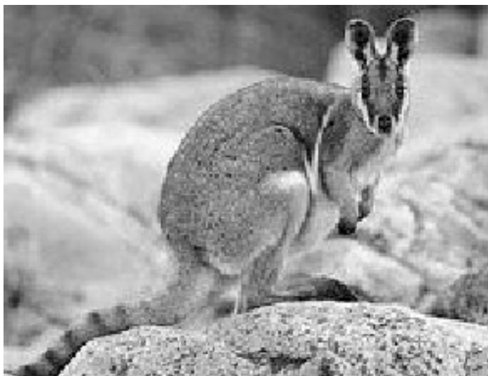
The yellow-footed rock wallaby—a small, colorful breed of kangaroo known to roam the Casella Vineyards is the true namesake for Yellowtail wine.