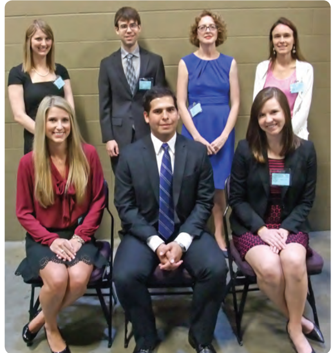
Above right: Outstanding Candidates who attended the ceremony were recognized for their high achievement on the Uniform CPA Exam.