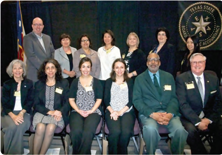
Above left: Members of the Austin Chapter of the Texas Society of Certified Public Accountants, who generously volunteered their time at the event.