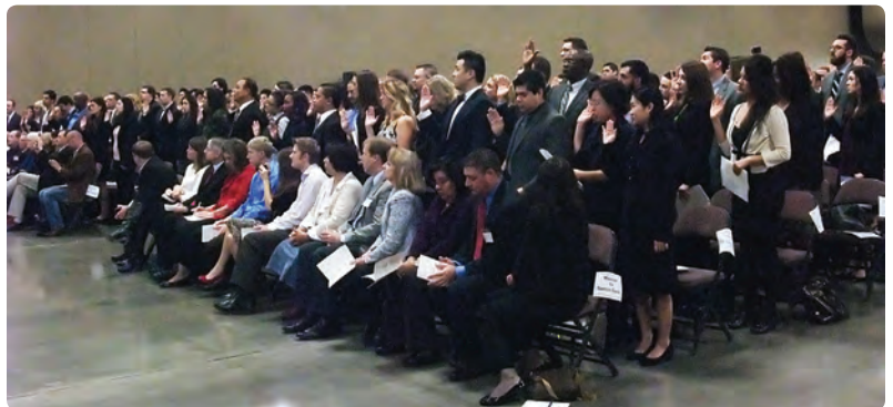
ABOVE: Candidates take the Oath of Office.